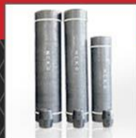
Artificial Graphite Electrodes