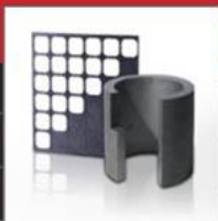
Carbon Fiber Products

> 100 YEARS EXPERIENCE IN ENGINEERING & MANUFACTURING OF CARBON MATERIALS